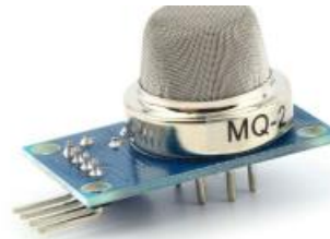
Fig: Gas Sensor

The sensor is easy to use and can be easily incorporated in a small portable unit.