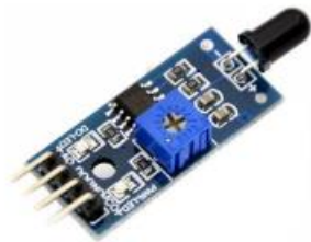
Fig : Flame Sensor

FLAME SENSOR: A flame detector is a sensor designed to detect and respond to the presence of a flame or fire. It also can detect ordinary light source in the range of a wavelength 760nm-1100 nm. The detection distance is up to 100 cm.